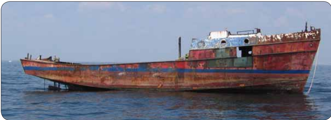
The 5th vessel deployed on the Townsends Inlet Reef, a 77-foot commercial fishing boat.

FACT: Townsends Inlet reef site is the newest addition to the New Jersey artificial reef network. Since 2005, 8,406 cubic yards of reef material have been placed on the reef.